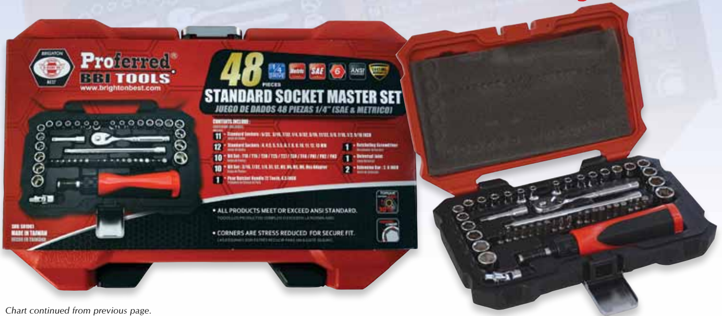
Chart continued from previous page.