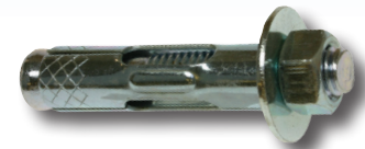
Sleeve Type Anchor