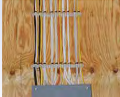
Cable holder can be affixed to: wood, metal, fiberglass frame, and above electrical service box.