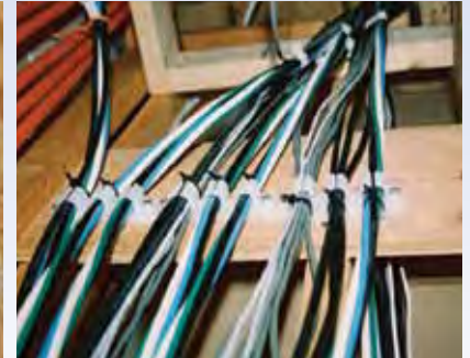
Keep the integrity of the high and low voltage wires: computers, alarm systems, closed circuits, and in boats to prevent fraying.