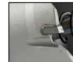
Triple Edge Tooth Geometry